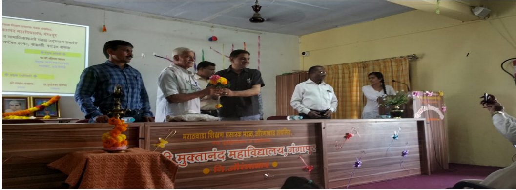
Social Sciences Forum (21-12-2019)