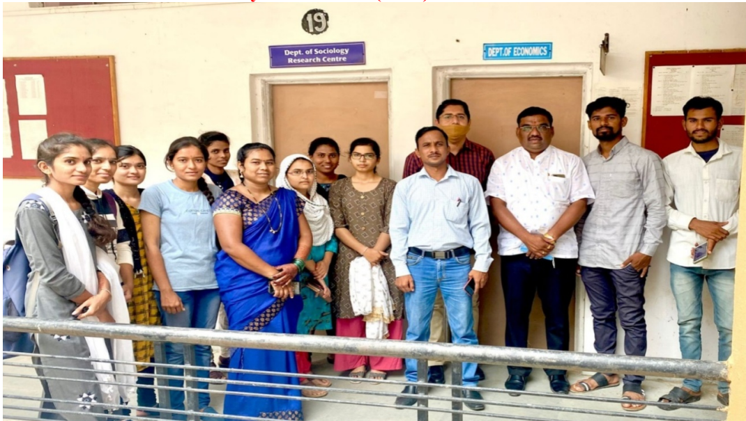
Departmental Project Work & Visit of External Examiner (2020-21)